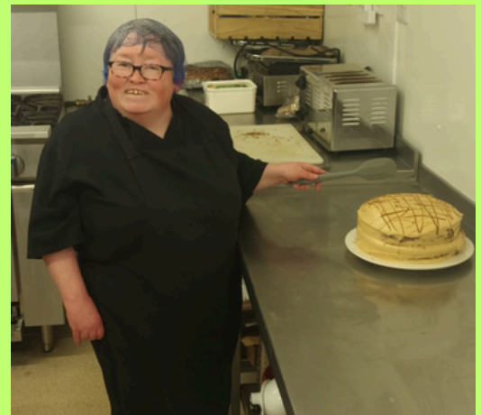
The chocolate cake in question!